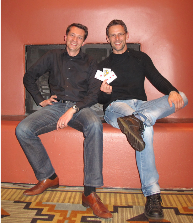
The “trump card”

Committee structure), paper pre-accepts, and discussions at the physical meeting that do not include all of the papers’ reviewers. To shorten some of the especially long discussions and encourage the acceptance of controversial papers that had clear value, each of the 50 PC members was given a card that they could use as a “trump card” to accept one paper in which they personally strongly believed, despite other committee members’ reservations. Although this practice did not carry over to subsequent ICSEs, it was used by three reviewers at ICSE 2011. And guess what: these were right decisions. Looking back, the three papers in question have done really well!